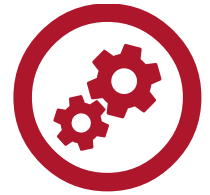
Easy inlet configuration