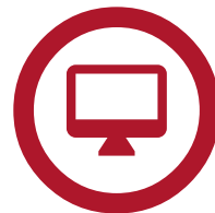
Blackline Live™ web portal